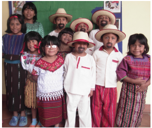
Celebrating Guatemalan Tradition

Semillas de Amor's mission is to raise and educate thoughtful, compassionate, caring beings with excellent critical thinking skills and a commitment to social justice and civic responsibility. We focus on character and academic excellence in a creative, safe, loving, and nurturing environment.