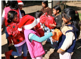
Playing Santa to the poor children of the community

In 2008, Guatemala put a stop to international adoptions, crippling the resources of Guatemalan orphanages. Many orphan homes had to close.