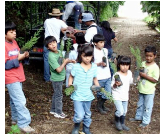
Planting trees for a reforestation project